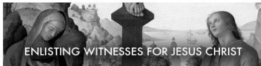
ENLISTING WITNESSES FOR JESUS CHRIST

assumptionschool113@gmail.com karen.assumption@hotmail.com