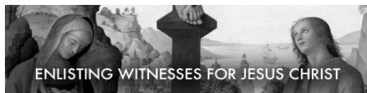
ENLISTING WITNESSES FOR JESUS CHRIST

Come Share Your Faith as a Catechist – Ever wondered what the catechetical ministry is all about? The requirements are simple: a love for God, love for our Catholic faith, and a willingness to spread the news of Jesus Christ. Please contact the Religious Education Office to set an appointment to receive all the information you need. One of the most rewarding things you can do is share your faith with the youth of our parish in our Religious Education Program. When we share our faith, we grow in faith!