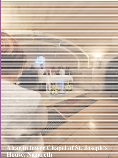
Altar in lower Chapel of St. Joseph's House, Nazareth

O n my pilgrimage to the Holy Land we were blessed with a stop at the Church of the Annunciation in Nazareth. Nearby was the Church of St. Joseph where the Holy Family lived while Jesus grew up. It was built in 1914 over the remains of much older churches. It was built in the Romanesque Revival style.